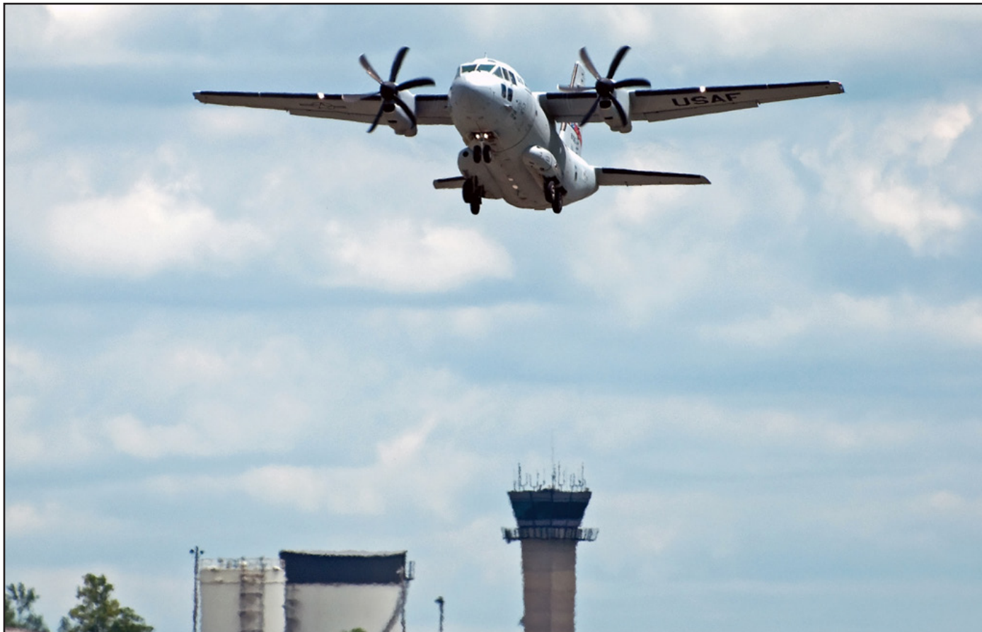
The 179th Airlift Wing's C-27J Spartan